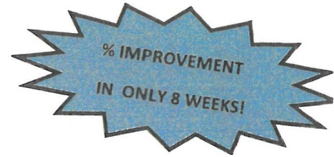
Avg. Year 4 Writing Test Scores