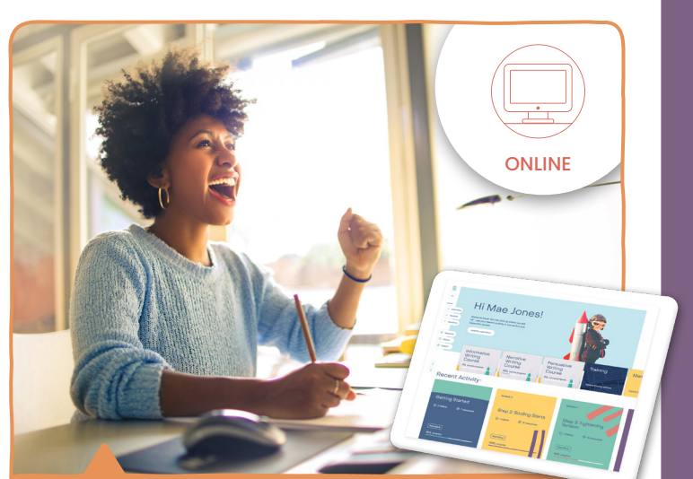
Online workshops include a 3-month Teacher Hub subscription – get access to over 500 writing resources!